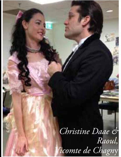
Christine Daae & Raoul, Vicomte de Chagny