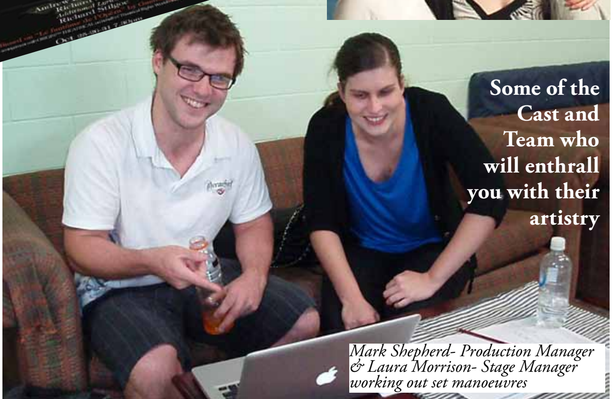
Some of the Cast and Team who will enthrall you with their artistry