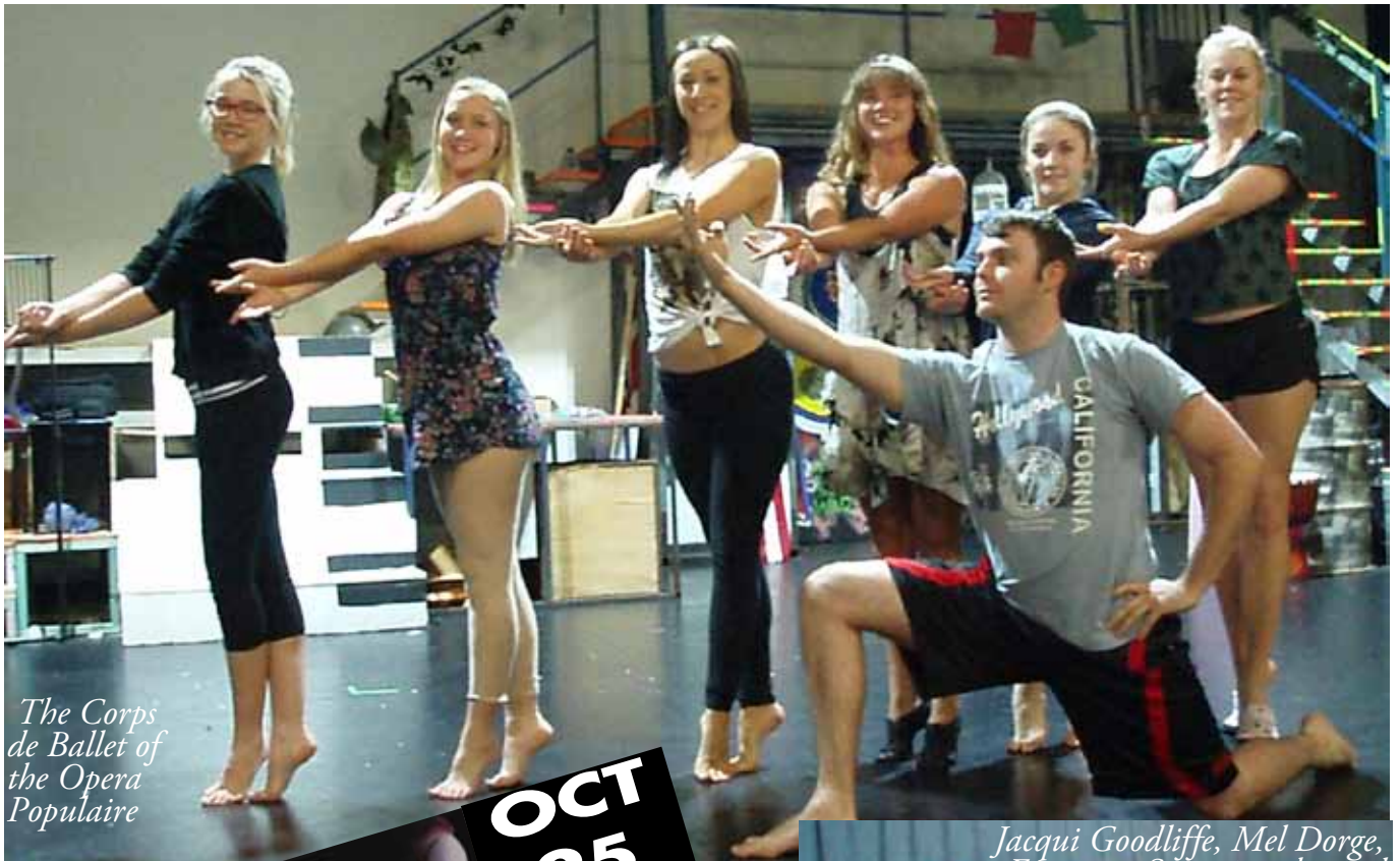
The Corps de Ballet of the Opera Populaire