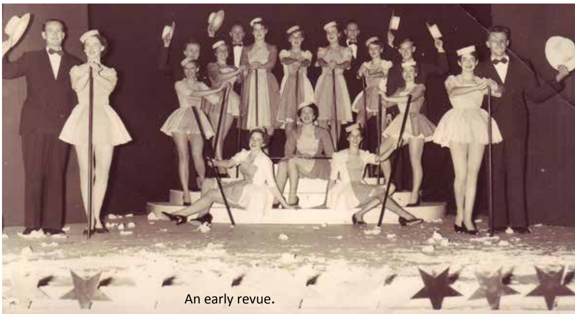
An early revue.