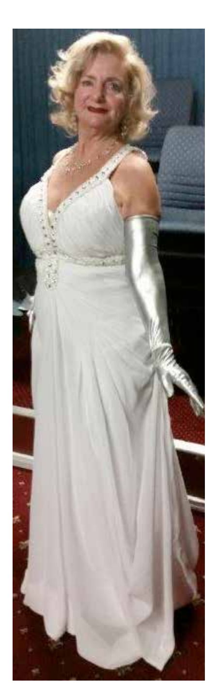
Spotlighter August 2015

Special Thanks to volunteers and staff for the morning tea which was very popular on the cool wet day. Thank You Golden Girls for a very enjoyable morning of musical entertainment.