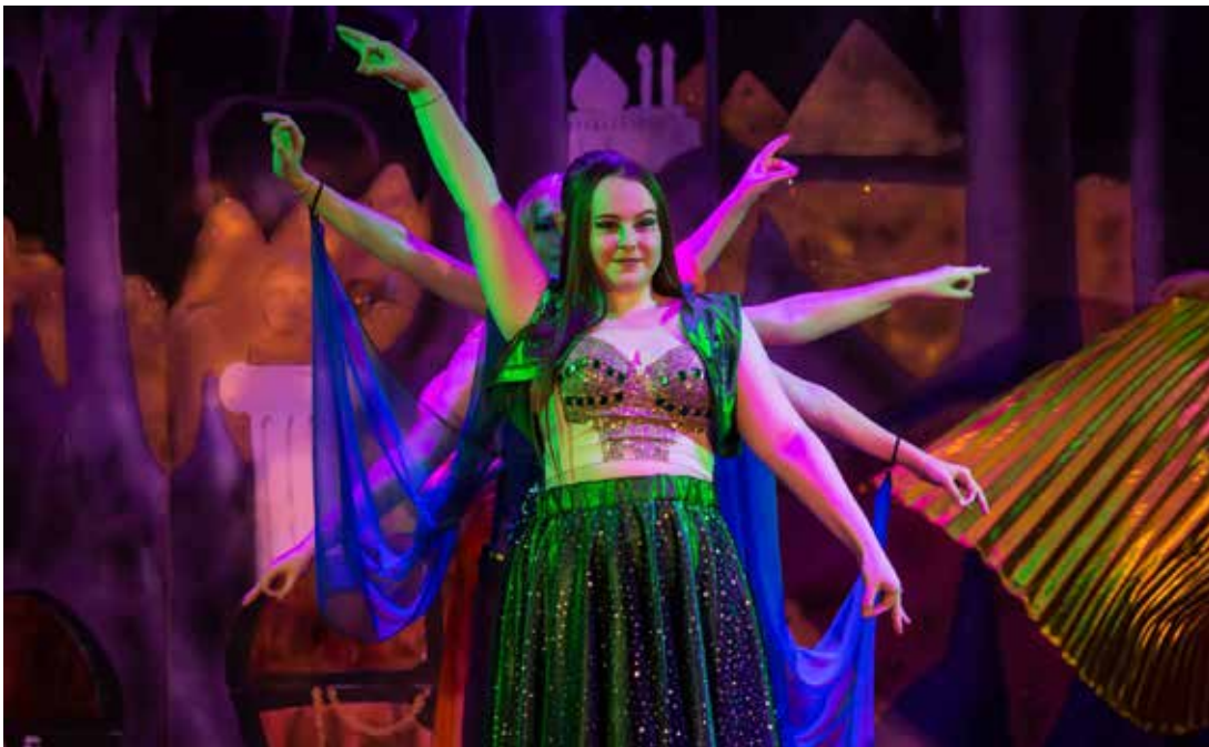
The following photos were taken by Nanga Mai Photography during Spotlight Theatrical Company's fabulous recent pantomime A Lad 'n' His Lamp .