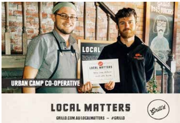
Grill'd - in Benowa Gardens a local Sponsor